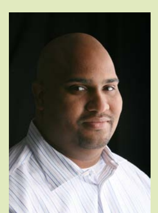
asking for federal funds.

Having initially dealt with a market where rates are typically below one dollar, Johnson is optimistic about the Asian markets, where transpacific rates are significantly higher. "The dollar amount is so high that it only takes one air waybill a day to pay for the system," he said. - lan Yau