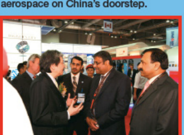
Unique networking opportunities with the world's leading airlines, airports, IT providers, equipment manufacturers and many others.