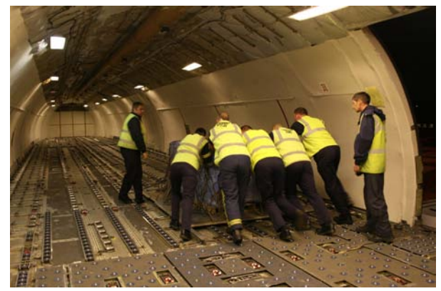
DC10-30F aircraft loaded for the Libyan air charter.

Chapman Freeborn Airchartering coordinated the movement of more than 250 tons of fire fighting foam from Europe to Benghazi, Libya, to help tackle a blaze at a petrochemical and refining complex.