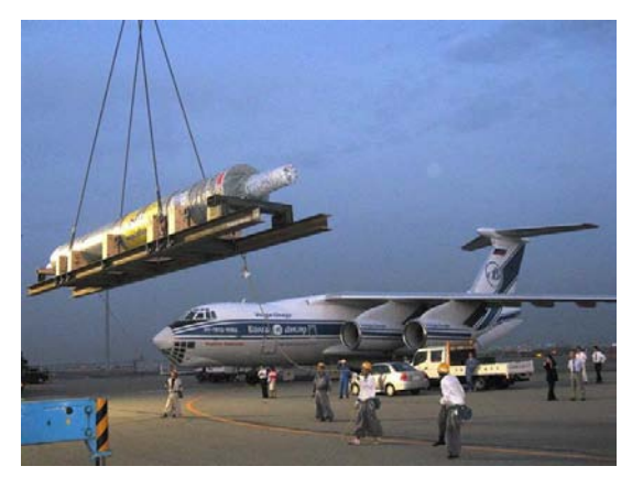
The 40 tonne consignment eclipses an earlier record.

WWPC/Finland, Procargo Ltd, has followed up its record single cargo load operation, to transport a 39 tonne metallic roll for a paper machine from Finland to the USA, with another record transport of a