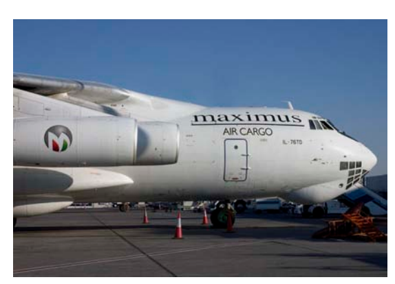
Fleet overhaul will extend life of Abu Dhabi headquartered Maximus' heavy-lifter Ilyushin fleet.

Maximus Air Cargo, the Abu Dhabiheadquartered specialist 'heavy-lifter', is undertaking a $10 million overhaul of its Ilyushin fleet - extending the operating lifespan initially by seven years.