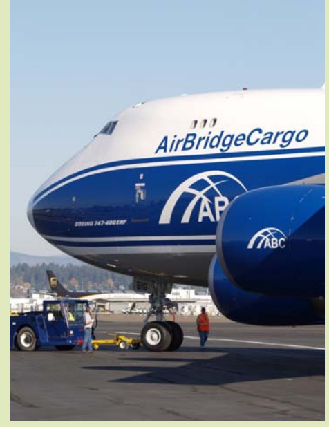
In for the long haul - AirBridge Cargo B747-

Unlike some other carriers, we don't have just one customer but several. This