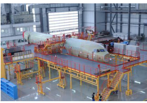
Airbus production in China expected to reach four aircraft a month by 2011.