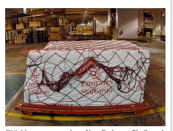
Weighing no more than 3kg, Emirates SkyCargo's new low-cost White Cover has proved popular with shippers on the pilot programme.

One of the 'White Cover's distinct properties is its breathability – it resists air and water penetration while enabling trapped moisture to escape – making it