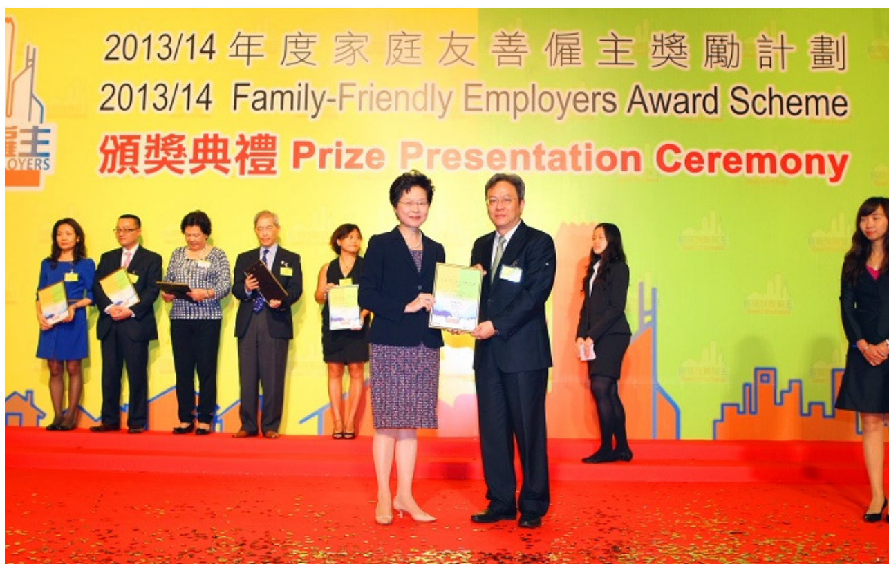
HAFFA Chairman received “Family-Friendly Employer” award from Mrs. Carrie Lam Cheng Yuet-ngor, GBS, JP, Chief Secretary for Administration at the Prize Presentation Ceremony.

Among the challenges in a fast-paced, demanding environment such as the logistics industry are the pressures on manpower as well as high turnover rates. By acknowledging that employees are a company’s most valuable asset, employers recognize that a happy workforce produces more effectively and efficiently. HAFFA’s commitment recognizes that care and consideration towards its staff helps retain a skilled workforce and assists not only in keeping the industry competitive, but furthers its growth.